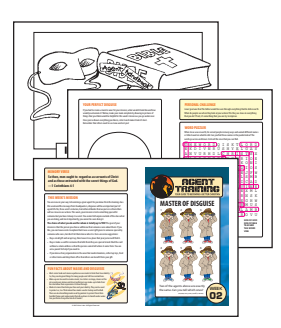
Activity Sheets for Week 2 can be found on the Resource CD.

Don't forget the mission brief activity sheets for this week. Make sure to assiign a leader at the door to make sure each child gets one before they leave for the day.